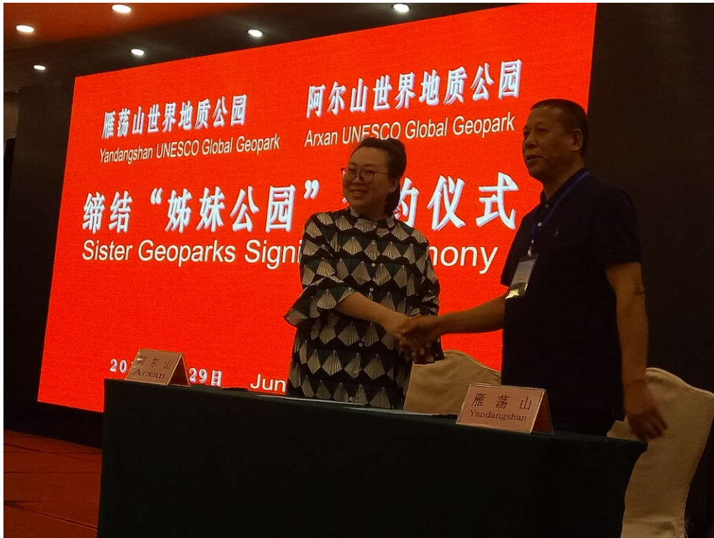
Concluded Sister Geopark with the Yandangshan UNESCO Global Geopark, June 2018