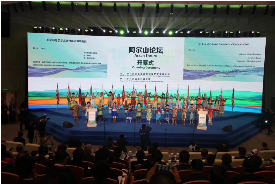
Axran Forum, September 2018