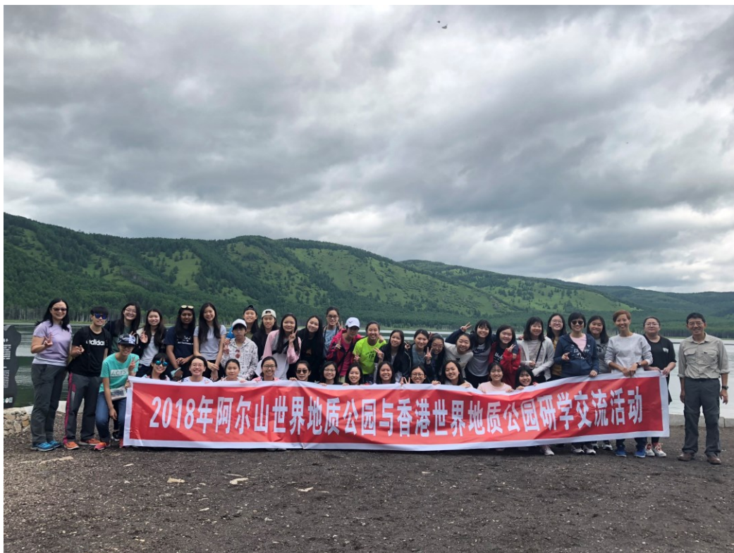
Research Exchange between Arxan Geopark and HongKong Geopark, July 2018