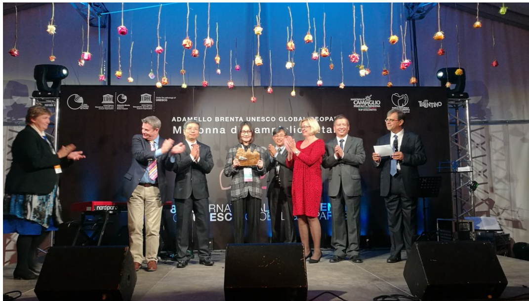
Awarded the plaque to Arxan UNESCO Global Geopark in September 2018

Representative Photo (from the most important event this year)