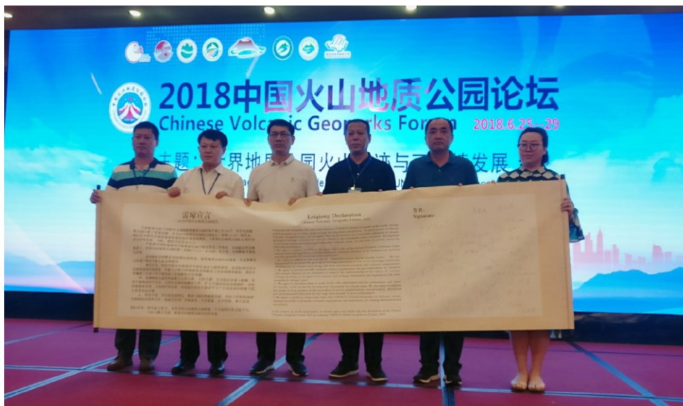
Participated in the 2018 Volcanic Geopark Forum of China, June 2018